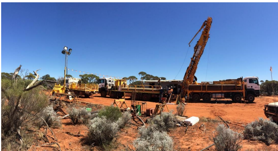
Figure 3: DDH1 high powered Sandvick multipurpose RC/Diamond truck mounted rig

DDH1 will utilise a high powered Sandvick multipurpose RC/Diamond truck mounted rig, top of the line for power, accuracy and has 2,500m NQ depth capacity. Rumble is fully funded to complete this program and any further drilling if required. These 2 elements provide the flexibility if a discovery is made.