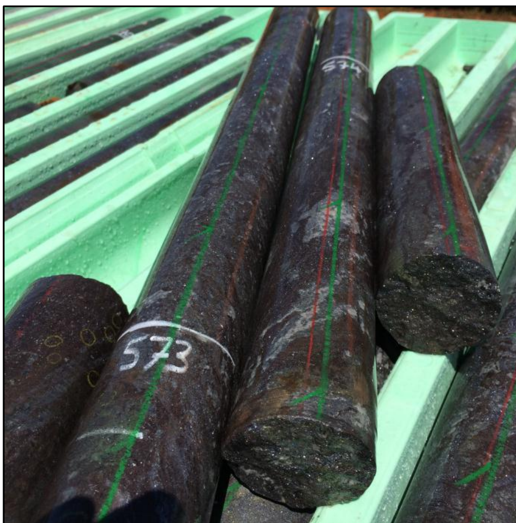
Drill core of massive lead-zinc sulphides in drill hole HRD061 – Hera North

*Note: The mineralised interval contained visible gold and as such, the gold assays are generated using the screen fire assay method (refer JORC Table 1). The screen fire assay method is considered the most appropriate method for the assaying of coarse gold mineralisation