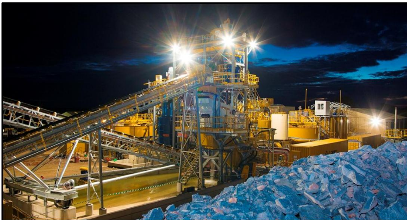
Hera Processing Plant

Aurelia maintains a commitment to the ongoing exploration of the Hera-Nymagee Project and considers both deposits have the potential to evolve into very large "Cobar style" mineral systems.